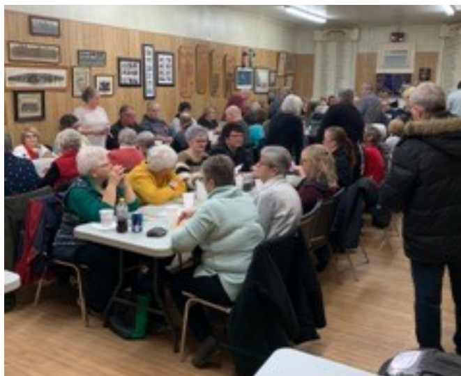
2019 Christmas Meat Draw